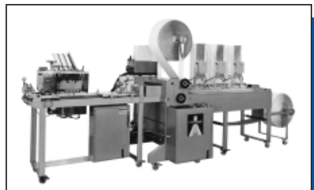
Purchase of some options may change specifications and requirements