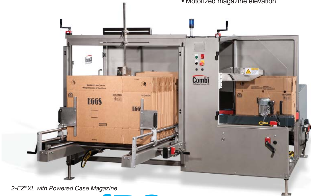
2-EZ ® XL with Powered Case Magazine