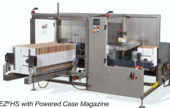
2-EZ®HS with Powered Case Magazine

The Combi 2-EZ®HS, 2-EZ®SB, 2-EZ®SB Plus are capable of erecting and sealing the widest range of case sizes and styles.