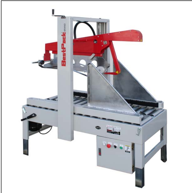
ASF Automatic Uniform Sidedrive Flap Folder