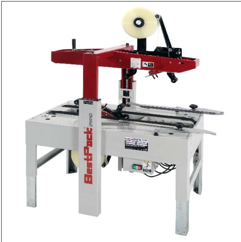
MBD22 Manual Bottom Drive