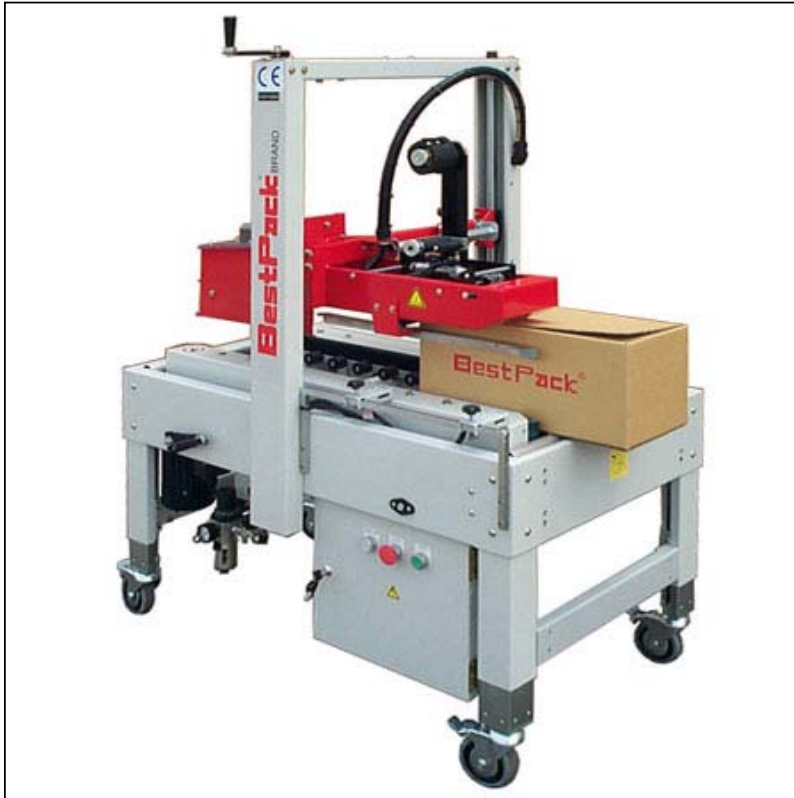
AS1E Automatic Sidedrive One Edge