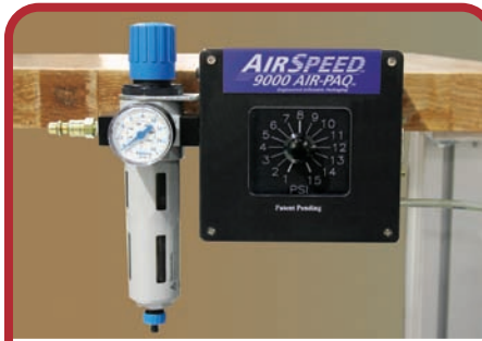
Automatically gauges pressure