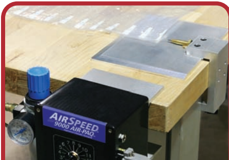
Clamps to any table surface