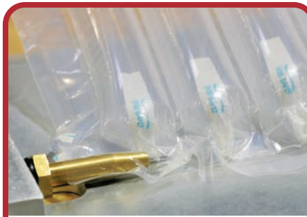
Inflates bag with accuracy and speed.

The AirSpeed™ 9000 Air-Paq™ product line's unique and patented design keeps a series of adjoining air tubes securely inflated to cushion and protect lightweight products during shipment. The tubes are connected via a series of patented one-way valves – in the unlikely event that one air chamber is punctured, the others remain inflated, protecting your goods.