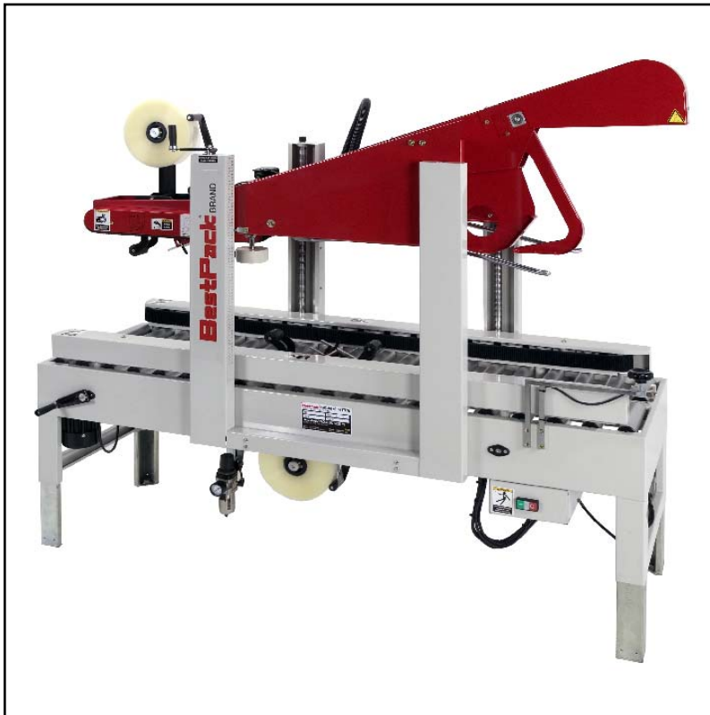
AQ Automatic Quad Drive