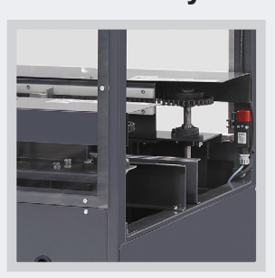
Chain and lug provides positive drive