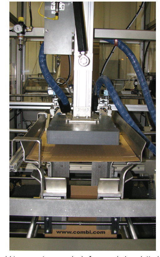
Combi tray erectors precisely form and glue slotted style trays, trays with tuck flaps and trays with one piece lids