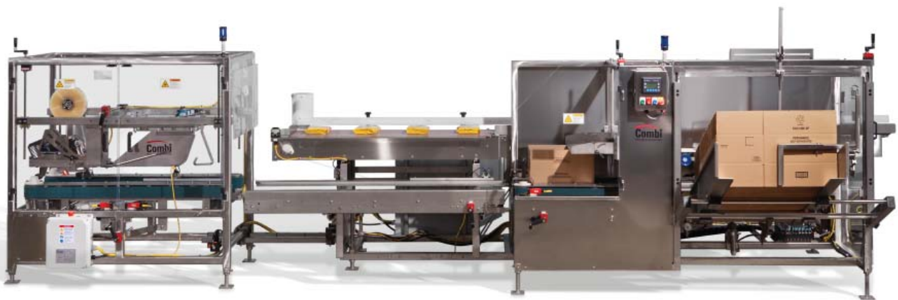
2-EZ ® SB Ergopack optional Stainless Steel frame