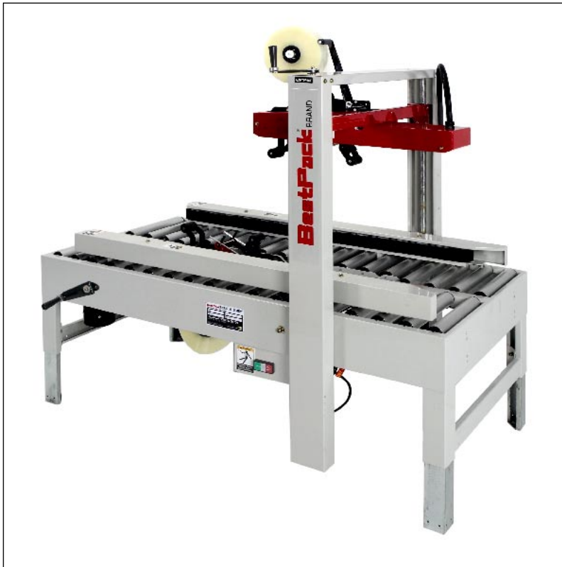
MSL22 Manual Side Drive Low Profile