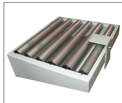
Infeed/Exit Conveyor w/ Stabilizer