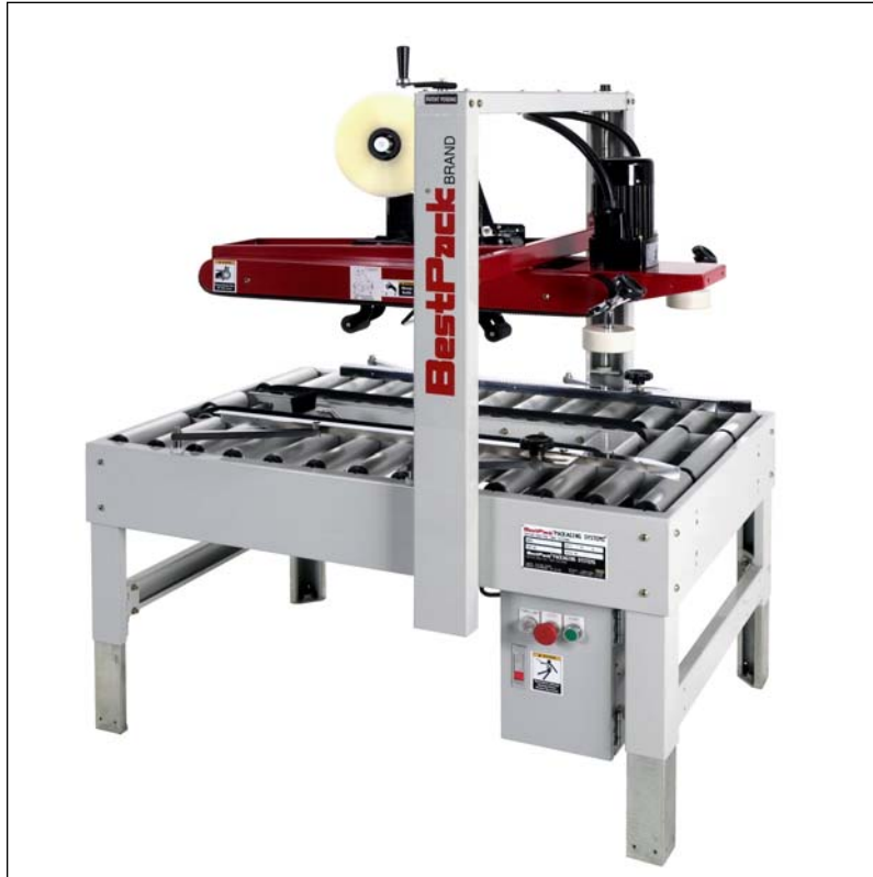
MTLW Manual Top Drive Low Profile

The BestPack® MTLW Series are Semi-Automatic Adjustable Tape Carton Sealers engineered for economical, effective operator-fed closure applications. The MTLW's air-driven brushes tuck the leading and trailing tabs that hang over the bottom of the carton. These brushes facilitate top sealing of cartons from a min. height of 1/2" high, 3" lower than the MT's min. height of 3.5".