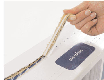
Easy, fast, user-friendly opening with tesa® tear tapes!

By adding the tesa opening function to your cardboard, you add a valuable capability to your product. You can offer a solution that protects the content, increases customer satisfaction by providing a user-friendly and fast opening system, and eliminates the need for a cutting tool.