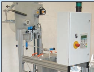
tesa Flexible Taper

350 Tucapau Road Duncan, SC 29334 Phone: 864-486-3000 E-mail: Sales@erhardt-leimer-us.com