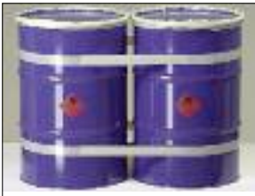
Bundling heavy goods