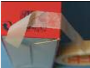
tesa® 51128 securing high-end boxes without carton damage