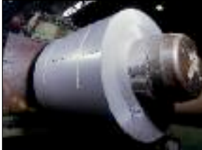
End-tabbing steel coils

tesa® TPP (tensilized polypropylene) tapes offer features and functionality that go well beyond common packaging and bundling tapes. As some of the strongest tapes on the market, tesa® TPP tapes provide industrial strength you can rely on time and time again.