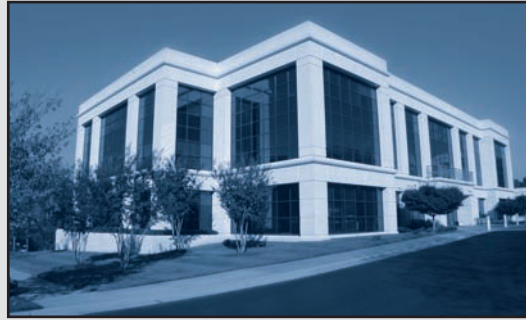
tesa tape, inc. North American headquarters

For over a century, tesa has pioneered the development of pressure-sensitive adhesive tape technologies. This rich tradition of innovation dates back to 1882 when the company's founder patented a method for manufacturing medical adhesive dressings. With this invention came the beginning of a global enterprise dedicated to the development and promotion of advanced adhesive tape solutions. Today, the world-wide tesa enterprise services customers in over 100 countries around the globe and holds hundreds of product patents. In North America, tesa markets many diverse product lines including double-sided fastening tapes, masking tapes and associated products, packaging tapes, and commonly-used industrial tapes. These are in addition to the company's duct and specialty tape products. At tesa, it is our charter to provide our customers with service levels and applications expertise that are second to none in the industry. With this as our goal, we stand committed to providing adhesive tape solutions beyond the roll!