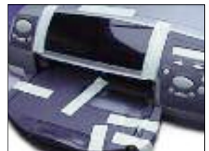
tesa® 64250 protecting goods with unique shapes