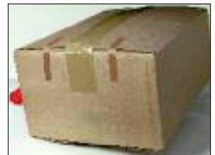
Reinforcing cardboard packaging