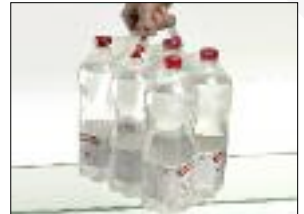
Food and beverage packaging