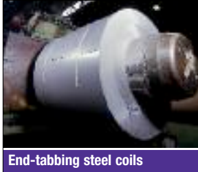
End-tabbing steel coils

tesa® TPP (tensilized polypropylene) tapes offer features and functionality that go well beyond common packaging and bundling tapes. As some of the strongest tapes on the market, tesa® TPP tapes provide industrial strength you can rely on time and time again.