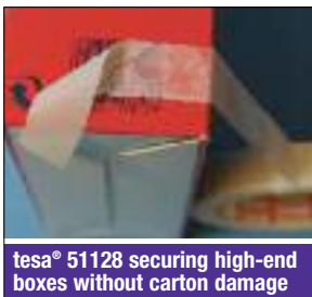
tesa® 51128 securing high-end boxes without carton damage