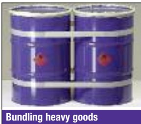
Bundling heavy goods