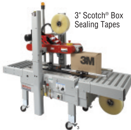
3" Scotch® Box Sealing Tapes