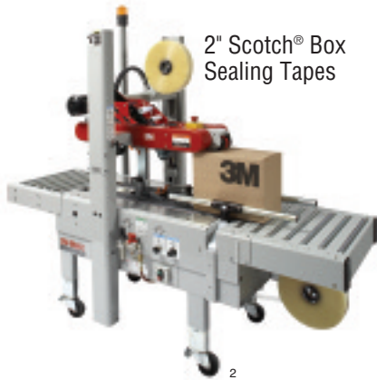
2" Scotch® Box Sealing Tapes