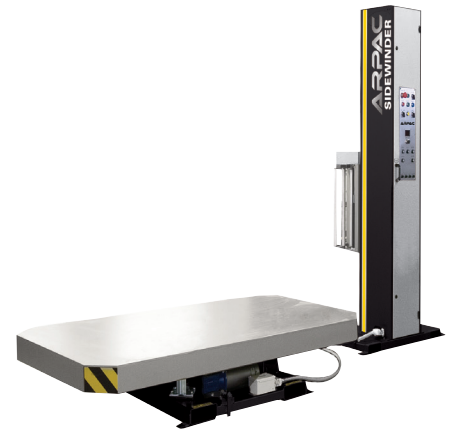
SIDEWINDER 6 HP WNW