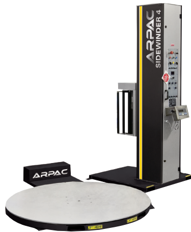
SIDEWINDER 4 LP WNW