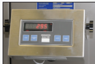
WRAP-N-WEIGH® Operator Controls