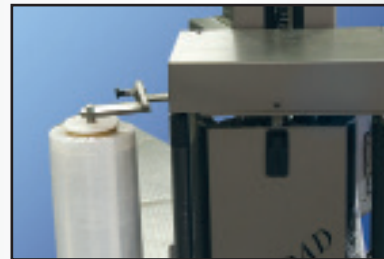
"Swift Change" Film Mandrel