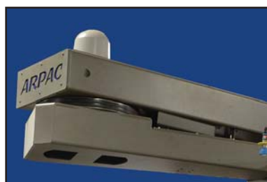
Heavy Duty Slewing Bearing and NEMA 3R Commutator