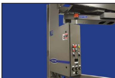
User-Friendly Operator Controls