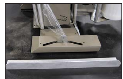
Electric Clamp, Cut and Wipe Down System