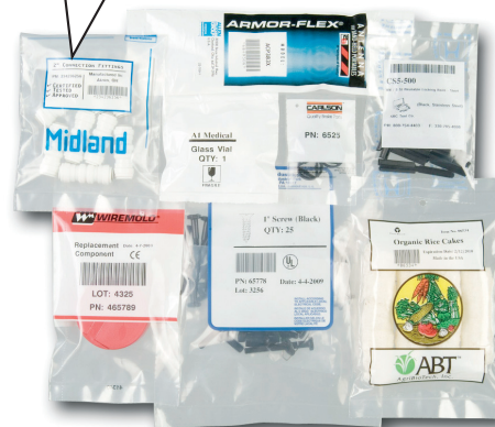
Actual Bag Samples