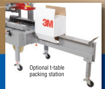
Optional t-table packing station