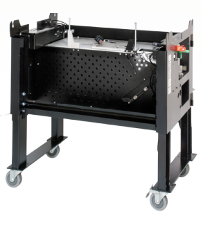
Semiautomatic model shown