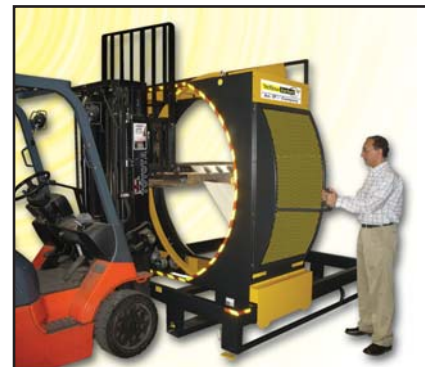
Standard Manual Model US Patent 6,729,106 B2

IPDS PACKAGING 800-277-7007 www.ipack.com