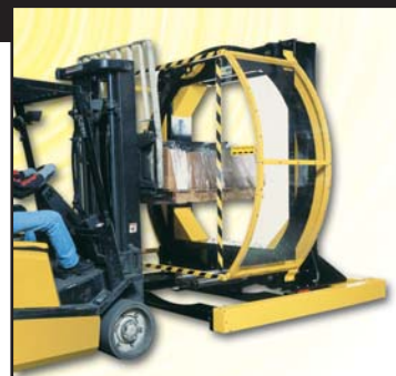
Semi-Automatic Model US Patent 6,729,106 B2

Get a grip on your stretch wrap needs without ever leaving the seat of your forklift.