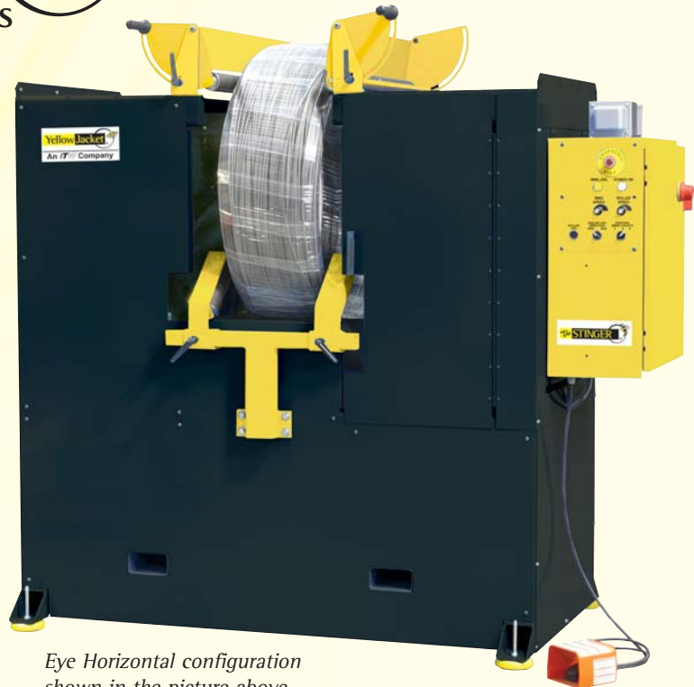
Eye Horizontal configuration shown in the picture above